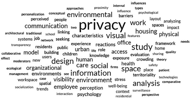
Figure 1. Word Cloud of Most Frequent Words Appearing in Titles of Publications Citing Archea (1977), Based on 85 Web of Science Citations

Clearly, privacy is the primary focus, with other frequent words concerning urban, organizational, housing, employee, work, physical and health environments; concepts and research in terms of visual, spatial, access, exposure, transparency, study, design, analysis, models, evaluation; interactions such as communication, information, knowledge, social; effects such as perceptions, well-being, stress; and a variety of less frequent words. Beyond frequencies, we can look at topics as represented by co-occurrences of primary words across the articles. Output from the Meaning Extraction Helper ( https://www.ryanboyd.io/software/meh/ ; with parameters set for removing stop words, tokenizing words, and using words occurring in at least two article titles) includes a matrix of 61 articles by 112 words. Principal component analysis (SPSS 28; varimax rotation; loadings > .4 but if multiple loadings over .4 , associated the word with its highest loading topic) to this matrix identified 38 factors (or topics) with an initial eigenvalue of greater than 1.0. (I also applied hierarchical cluster analysis to this matrix; however, the resulting dendrogram is too dense for use here, but is available from the author. As a summary, though, the most inclusive clusters included the same core