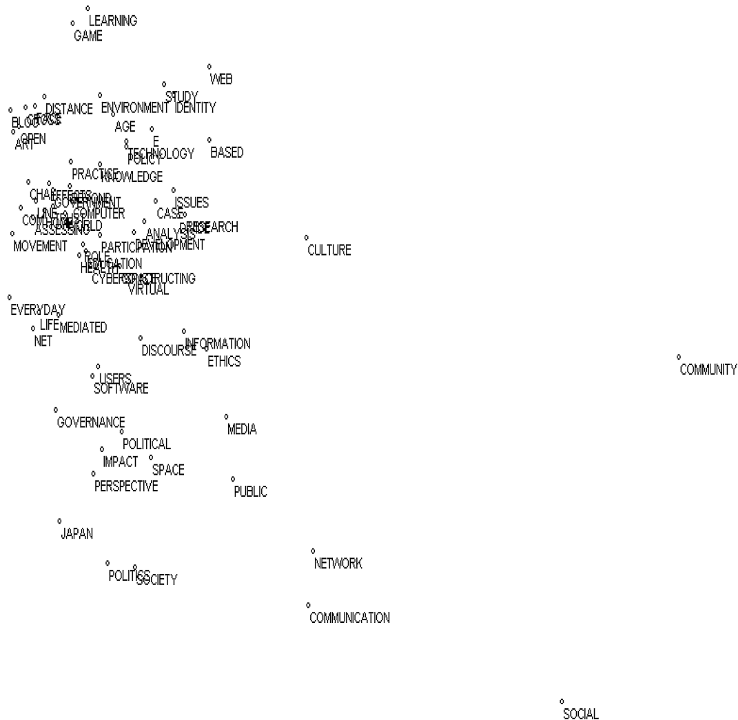
FIG. 2. Two-dimensional scaling of 72 most frequent words from 2004 conference paper titles.

is actually submitted, accepted, or presented. Second, the themes are quite succinct, and cannot possibly provide the range of topics included in even the session titles, much less the paper titles or abstracts. Further, few authors explicitly craft even their paper title to align with a conference theme. Because of submission deadlines, most researchers already have a study or paper in progress by the conference announcement. Finally, in fact the 2003 theme was not much reflected in the titles or abstracts, while the 2004 theme of “ubiquity” and words from the statement, such as community, context, and politics, did appear. But, except for “ubiquity,” those terms also appeared in the 2003 texts, and, of course, many other words and concepts appeared.